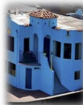
The Venetian Court 1924

The talk will conclude with a question & answer period