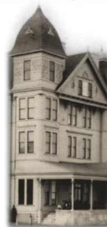
The Grand Hotel Capitola 1895-1929